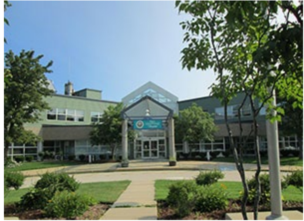
The front entrance of New Hampshire Hospital.

As a state-run behavioral health hospital in operation since 1842, New Hampshire Hospital in Concord, New Hampshire, has a long history of treating patients with severe psychiatric conditions. However, a changing landscape has led to new challenges related to workplace violence. Until a few decades ago, the hospital had many more patients than it does today, and staff became very familiar with their patients because they were often committed for life. Now the hospital sees patients for shorter stays, and some of these patients have more acute challenges and pose more serious threats and problems than in the past, particularly with an uptick in involuntary commitments and referrals from EDs. New Hampshire Hospital has become more of a “last resort” as other facilities have closed or become full; at the same time, the medical community has pushed to reduce the use of restraints and seclusion. These changes in patient population, acuity, and treatment techniques—along with concerns raised by staff—led New Hampshire Hospital to realize that they needed to give their workers new tools to prevent and respond to workplace violence.