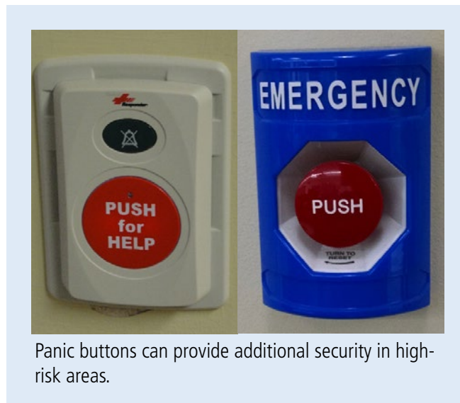
Panic buttons can provide additional security in high-risk areas.