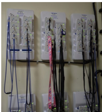
Associates at St. Vincent's Medical Center wear badges with alarms that will alert the security office if they feel threatened.

While hospital administrators can implement engineering and administrative controls to mitigate hazards present within a healthcare facility, protecting workers who work outside the hospital, such as in patients' homes, presents a different set of challenges. These challenges include being able to ascertain whether a worker is in a violent or potentially violent situation, and being able to quickly locate and respond to the incident. In 2015, St. Vincent's Medical Center in Bridgeport, Connecticut, evaluated the implementation of a GPS duress alarm system that case workers can wear while making home visits. The hospital plans to implement these GPS units in the year ahead.