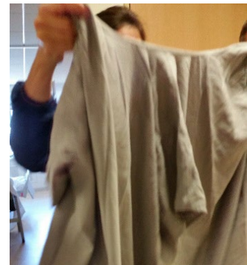
Patients at risk of violent behavior wear gray gowns so Saint Agnes's associates can quickly identify them and make sure to take extra precautions. The gowns are also designed with no strings, to reduce suicide risk.

Saint Agnes worked for several years to get off-duty police officers from the local community to serve in the ED. The hospital specifically wanted officers from Baltimore's Southwest district, as they know the community, they are familiar with some of the hospital's more challenging patients, and they have positive relationships with staff. The CEO successfully pushed to get these officers in the ED because their presence can help to deter bad behavior.