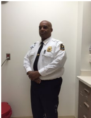
Milieu Safety Officers create a safe environment for staff and patients at Sheppard-Pratt.

At Sheppard-Pratt, a large behavioral health system headquartered in Towson, Maryland, many patients arrive upon referral from an ED. For these patients, violence prevention starts before they even arrive. Admissions staff can look up a patient's criminal record, and they take a detailed report from the ED, with nurses at Sheppard-Pratt talking with nurses at the ED, and physicians talking with physicians. These lateral conversations promote an open exchange of information. If the criminal record or ED report indicates a history of violence or aggressive behavior, Sheppard-Pratt can be prepared with extra clinical and security staff, and they can be ready to promptly administer emergency medications if needed to protect the patient or staff.