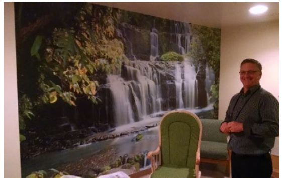
A member of New Hampshire Hospital's staff shows one of the facility's sensory rooms—a de-escalation strategy that has helped the hospital reduce patient-on-staff injuries.

Security is also an important part of New Hampshire Hospital's hazard control efforts. Campus police officers are commissioned by the state police force and are specially screened and trained for working in a mental health setting. Officers have been trained to respond to “code gray” (psychiatric) emergencies and assume a supportive role to staff. This type of response allows the officers to be present and immediately available if their services are needed. Campus police officers use defensive measures only when clinical staff have been unable to control the situation safely, there is extreme and imminent danger, and the nurse in charge specifically requests police assistance. This approach prevents the unnecessary use of force, which could escalate a situation and trigger a traumatic experience.