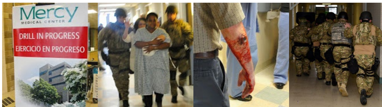
Mercy Medical Center's active shooter drill involved a large number of people in realistic scenarios—fake blood and all.

Behavioral Health Hospital, the security team, and human resources. The hospital coordinated the drill with the Massachusetts State Police and Springfield city police (including their Special Weapons and Tactics [SWAT] team), local tactical EMTs, and affiliated private security companies. Observers included other regional hospitals, school and college security, the Massachusetts Emergency Management Agency, the Homeland Security Council, long-term care facility representatives, and the Air Force Reserves, all seeking to learn and apply information to their own exercises. Evaluators noted participants' situational awareness, law enforcement response, communication, emergency operations, and treatment and triage. The exercise was followed by an open and blame-free evaluation that identified opportunities for improvement.