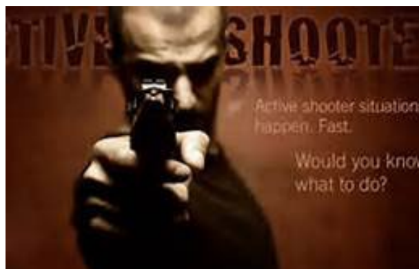
Centennial Hills Hospital Medical Center's LIVE Project trains healthcare workers on how to deal with an active shooter. The training includes a video, from which this screenshot was taken.

The LIVE Project was presented at The Joint Commission's 2015 Emergency Preparedness Conference, and it includes a video that the hospital produced.