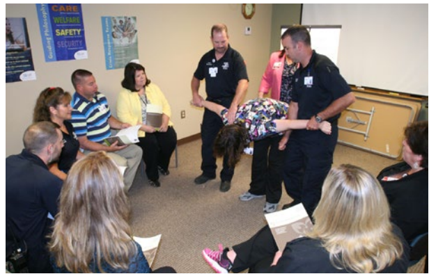
CMH incorporates role-play into its nonviolent crisis intervention and de-escalation training.

Citizens Memorial Hospital/Citizens Memorial Health Care Foundation (CMH) operates six skilled nursing homes, a hospital, and several other healthcare services in southwest Missouri. Nursing homes can pose risks for workplace violence, particularly when caring for patients with Alzheimer’s disease and/or dementia, which can lead to confusion and combativeness. As part of its comprehensive safety and health management system, CMH provides nonviolent crisis intervention and de-escalation training to all workers in its Alzheimer’s and dementia special care units, as well as to security staff and workers in certain other areas. As a result of these efforts and others, CMH has kept its injury rates and turnover rates below the national average. CMH’s continuous improvement shows how many of the same techniques that can be used to prevent violence in hospitals can also be applied to long-term care.